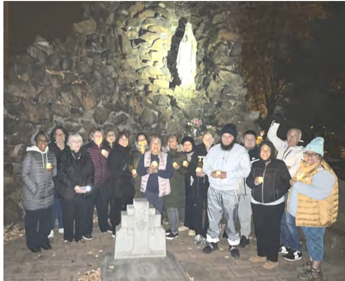
Evening Rosary in the Grotto