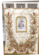
Induction of 3 New Members Rosary Altar Society