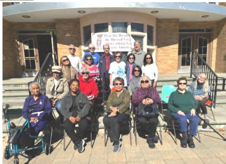
Public Square Rosary Rally